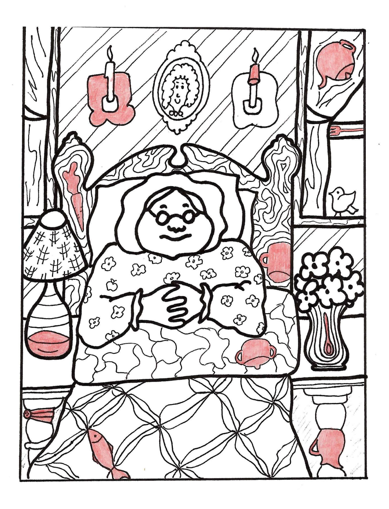
No part of this resource may be published in any form without exclusive written permission from Trust Jesus He Cares