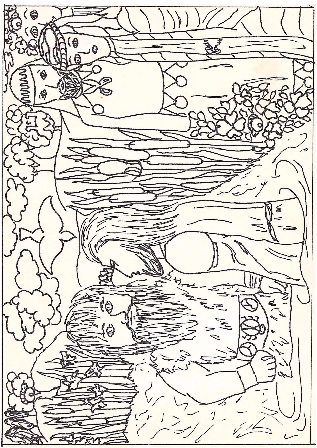
exclusive written permission from Trust Jesus He Cares